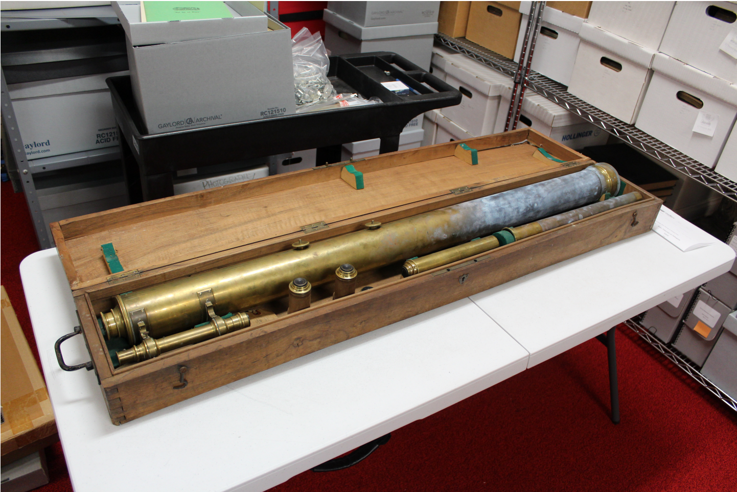
Storage case for Bardou & Son Telescope